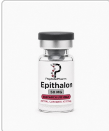
Epithalon 50mg - ET50-05042026