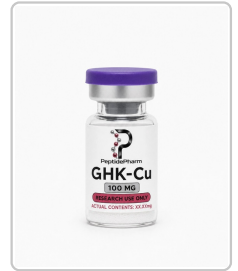
GHK-Cu 100mg - GU100-05042026