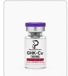
GHK-Cu 50mg - GU50-05042026