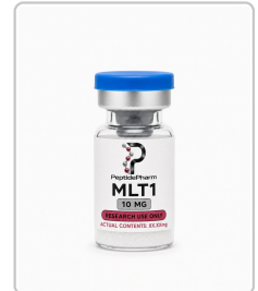
MLT1 10mg - MT110-05072026