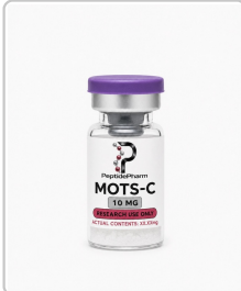
MOTS-C 10mg - MC10-05042026