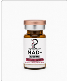
NAD+ 1000mg - NJ1000-05042026