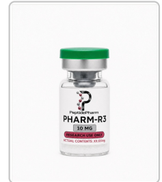
PHARM-R3 10mg - PHARMR310