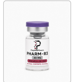
PHARM-R3 30mg - PHARMR330