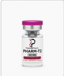
PHARM-T2 30mg - PHARMT230