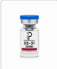
SS-31 50mg - SS3150-05042026